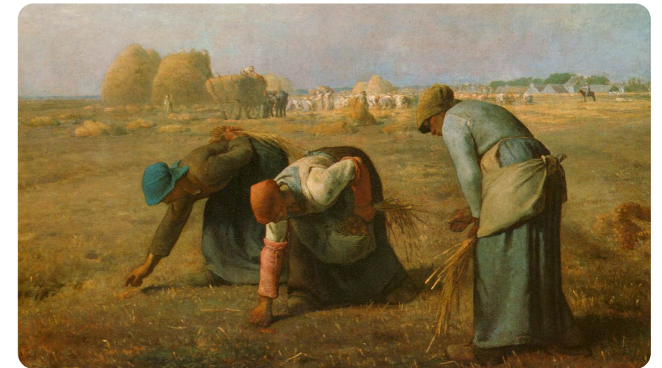
The Gleaners by Jean-François Millet, 1857

Realists use subtle tones and shades of natural colours. Their colour palette is largely browns, reds, black, greys and ivories.